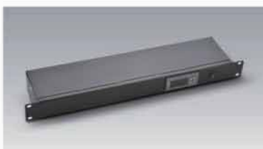
TC Digital Temperature Unit