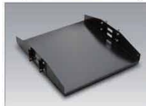
Double Sided Shelf