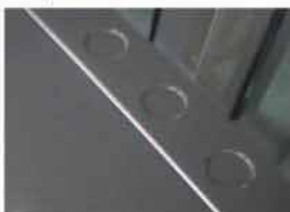
Circular threading hole (φ 50MM)